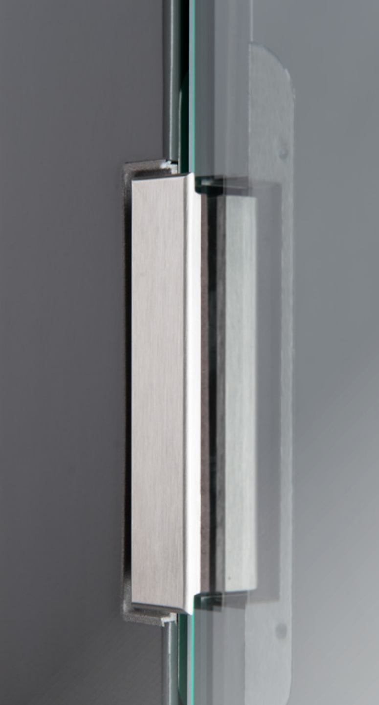
TECTUS Glass hinge system – closed