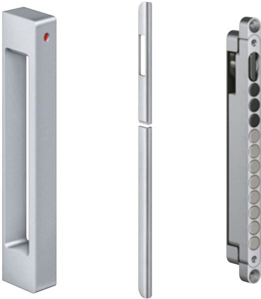
Handle KC 170/1 Lock