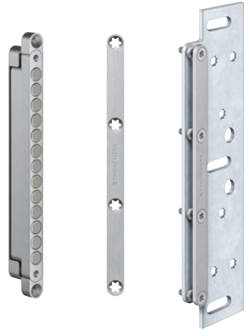
Closing Magnet KC 50